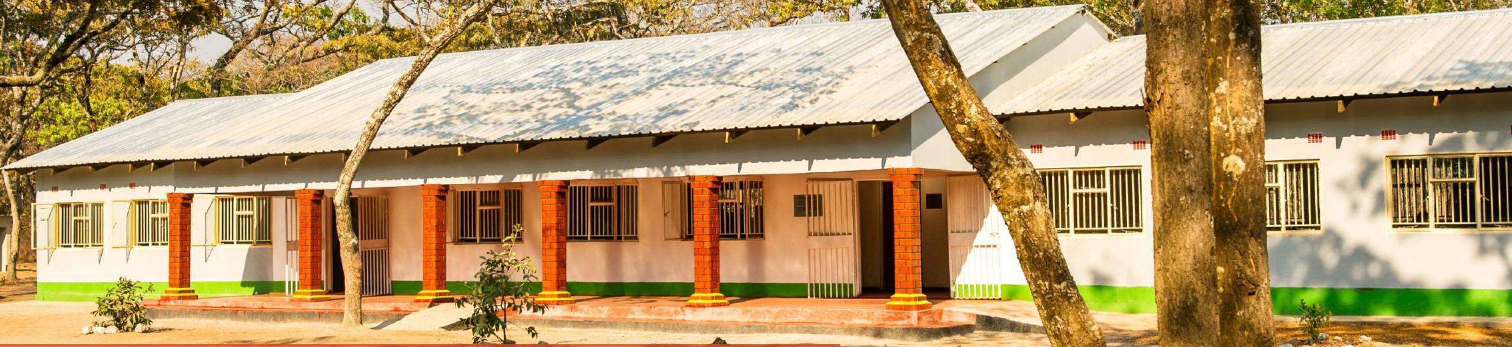
The first Middle School ever constructed near the Chimfunshi Wildlife Orphanage in Zambia, Africa