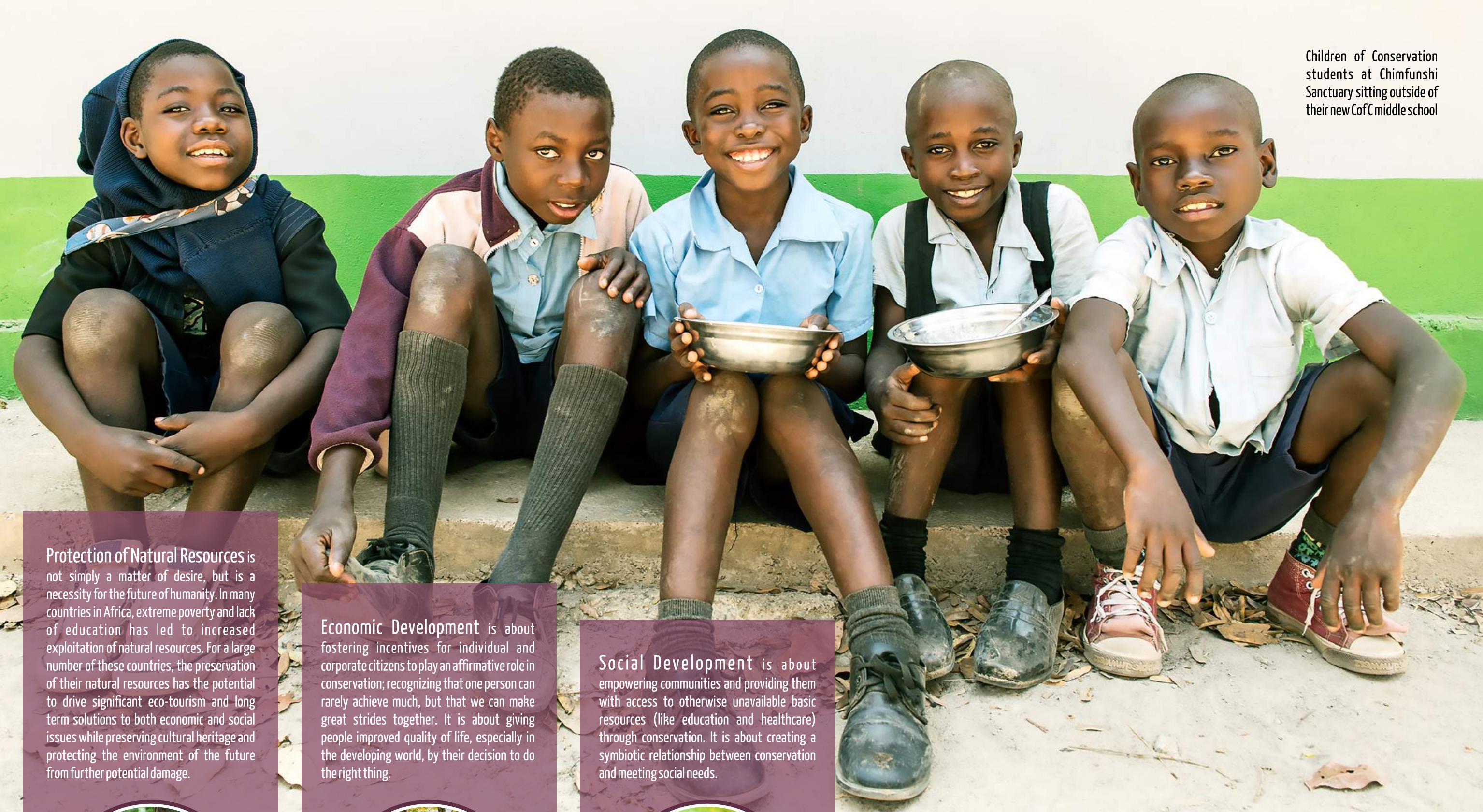
Children of Conservation students at Chimfunshi Sanctuary sitting outside of their new CofC middle school

Protection of Natural Resources is not simply a matter of desire, but is a necessity for the future of humanity. In many countries in Africa, extreme poverty and lack of education has led to increased exploitation of natural resources. For a large number of these countries, the preservation of their natural resources has the potential to drive significant eco-tourism and long term solutions to both economic and social issues while preserving cultural heritage and protecting the environment of the future from further potential damage.